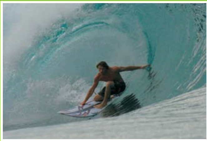
Ben 'Skindog' Skinner, European Longboard champion, surfs on Homeblown Foam